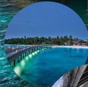
The eye-catching arrival jetty