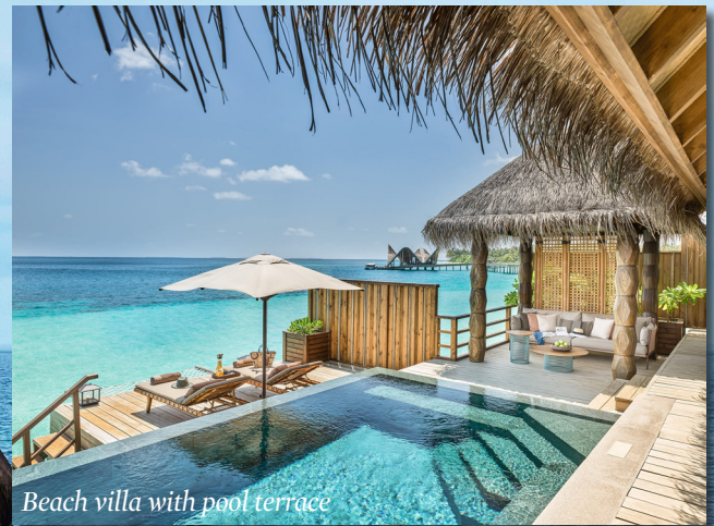
Beach villa with pool terrace