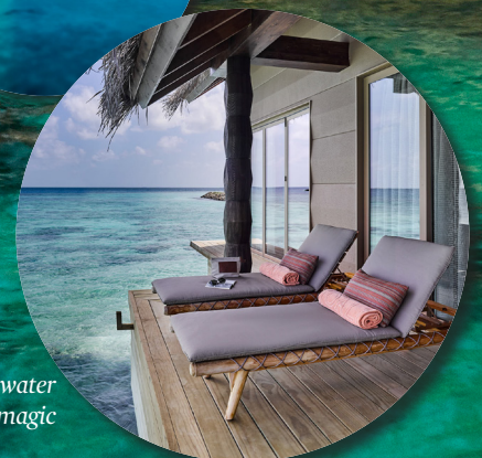
Jumping into the clear turquoise water from the over-water villas is pure magic